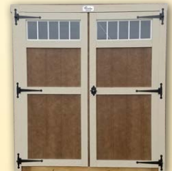
Transom Windows added to Wooden Doors