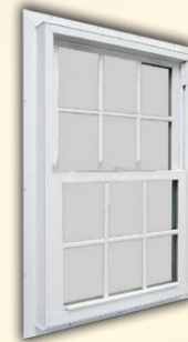
3' x 3' Thermal Window