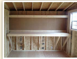
Example of Workbench