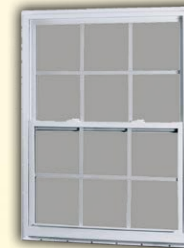
3' x 3' Window