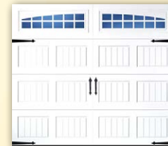
Carriage House Garage Door