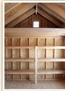
Example of Shelving

Prices are subject to change at any given time.