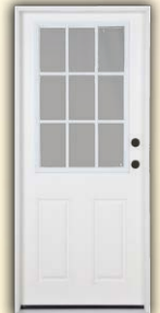
9 Lite 36" Door