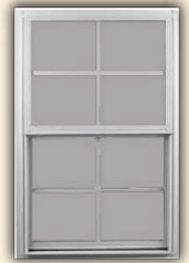
2' x 3' Window