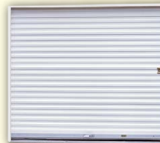
9' Roll-up Garage Door