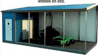
* 12'Wx25Lx10'8 8/16"H Roof, 1 side closed, 5ft enclosure room, 1-6wx6h door on end, 1-36"x80" walk door on side.