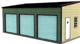
* 15'Wx30Lx11'8 9/16"H Roof, all enclosed, 3-8wx7h doors on side, 1-36"x80" walk door, 1-24"x36" window on end.

Examples of how the lean to can be customized.