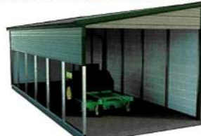
* 12'Wx30Lx11'8 9/16"H Roof, 1 side closed, 1-30ft panel, 1 end closed, 1 gable end.