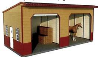
* 15'Wx30Lx12'8 10/16"H Roof, all enclosed closed, 1 center end closed, 1-10wx10h door on side, 1-12wx10h opening, 1-36"x80" walk door and 2-24"x36" windows, 2 sets of arch cutouts and a 3ft overhang.

*30 Day Workmanship warranty on all Buildings, effective day of Installation. *20 Year limited warranty on 12 Gauge framing materials assuming regular care and maintenance given to building.